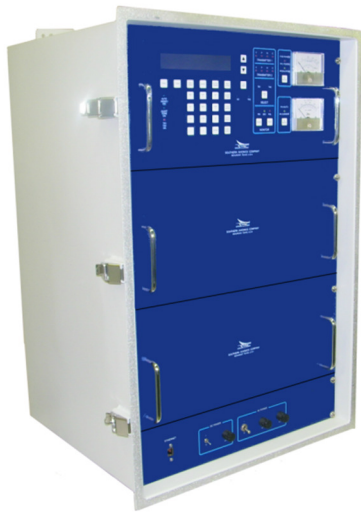
IP66 Weather Enclosure with Latches

5055 Belmont, Beaumont, TX 77707 Phone +409.842.1717/1.800.648.6158 (Toll Free in the US) Fax +409.842.2987 sales@southernavionics.com